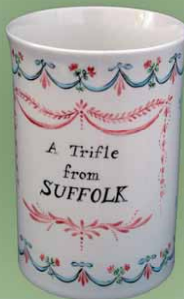
Hand-painted Heritage Mug - £85.00 HP / HM / BUT