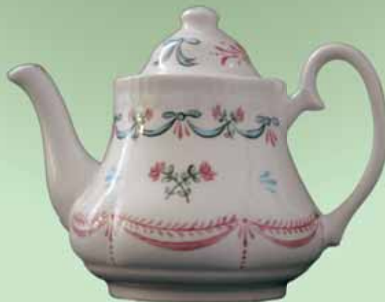
Hand-painted miniature Tea Pot - £59.95 HP / TP1 / BU